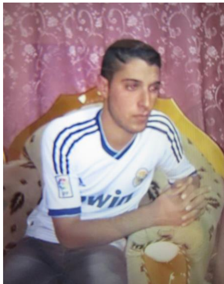
One of the victims of a Shi'a militia abduction.