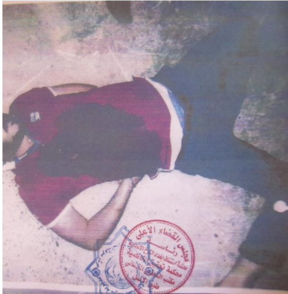
One of the victims of a Shi'a militia abduction.