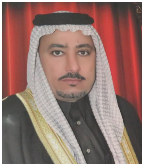
One of the victims of a Shi'a militia abduction.

"The militias broke into our home as we were sleeping. My son woke up and said 'what is happening?' They grabbed him from his bed and took him outside where more armed men and three black Hummers (vehicles) were waiting. Before leaving they took all our mobile phones. Outside one of them pointed to our car and asked if it was ours and when I said yes he shot at it. I tried to follow them but they shot in my direction. They also took our neighbour's son. We looked for them everywhere until the following day when their bodies were found in a mosque nearby. My son had been shot twice in the head and once in the chest. As they were taking my son from the house the militiaman who took my mobile phone asked 'what is his name?' They didn't even know my son's name; maybe they just took him because they were looking for young men and he was the only young man in our house."