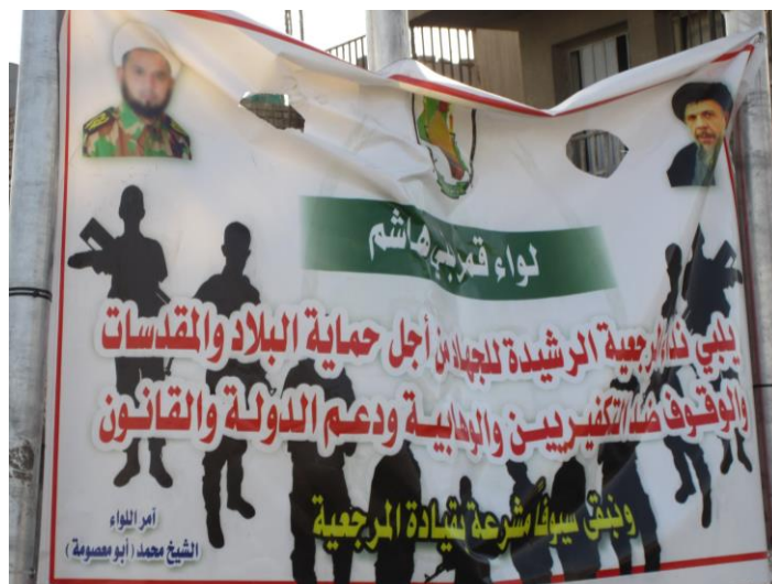
Banner of Shi'a militia, Liwa Qamar Bani Hashem.

In September 2014, a member of the 'Asa'ib Ahl al-Haq militia on duty at a checkpoint north of Baghdad, unaware that he was speaking in front of an Amnesty International delegate, said nonchalantly that "if we catch 'those dogs' [Sunnis] coming down from the Tikrit area we execute them; in those areas they are all working with DA'ESH (IS). They come to Baghdad to commit terrorist crimes. So we have to stop them". 19 In a similar vein, in June a militia