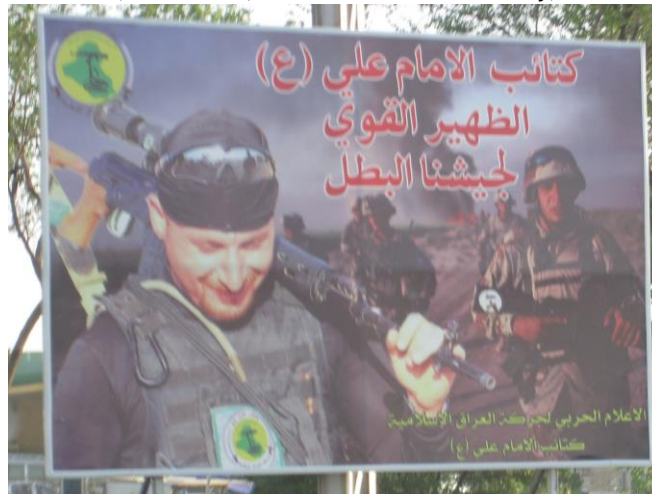
Banner of the Shi'a militia, Imam 'Ali Brigades, in Baghdad.

Under IHL, individuals, whether civilians or military, can be held criminally responsible for