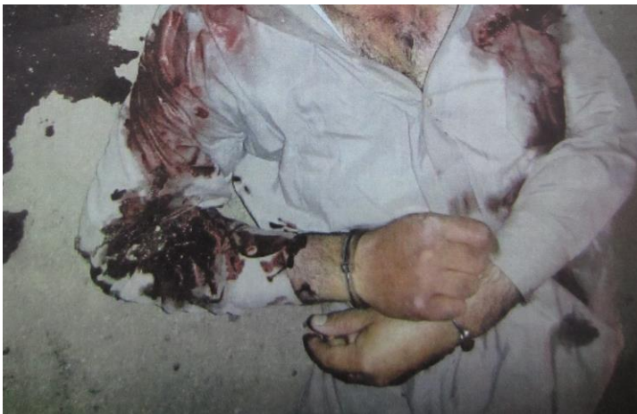
One of the victims of a Shi'a militia abduction.

This family and other residents of the area told Amnesty International that they believe that those responsible for the threats and extortion are members of 'Asa'ib Ahl al-Haq, a Shi'a militia. "They are very strong in our area, they are in control; nobody else could operate there" , a resident told Amnesty International. The fact that the family felt it would be neither useful nor safe to inform the police speaks volume about the atmosphere of lawlessness in the capital, where Shi'a militias know that they can act with impunity.