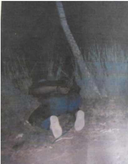
One of the victims of a Shi'a militia abduction.

In the city, mistrust has grown between Sunni and Shi'a Turkmen and Arab communities and between Arabs and Kurds. Accusations such as "the Sunnis [Turkmen and Arabs] are cooperating with IS" and "the Shi'a [Turkmen] and the Kurds are cooperating with Iran-backed Shi'a militias" are common – and in some cases true. Kirkuk has become a frontline city, with Peshmerga forces and Shi'a militias, at times backed by Iranian fighters, 7 battling IS fighters, supported by some local residents from Sunni Arab and Sunni Turkmen communities, to the south, west and north-west of the city. While Shi'a militias are operating openly, and in cooperation with or at least with the tacit consent of Kurdish Peshmerga forces, IS fighters are keeping a low profile and focusing on hit-and-run attacks, such as bombings, which they can carry out in areas they do not control.