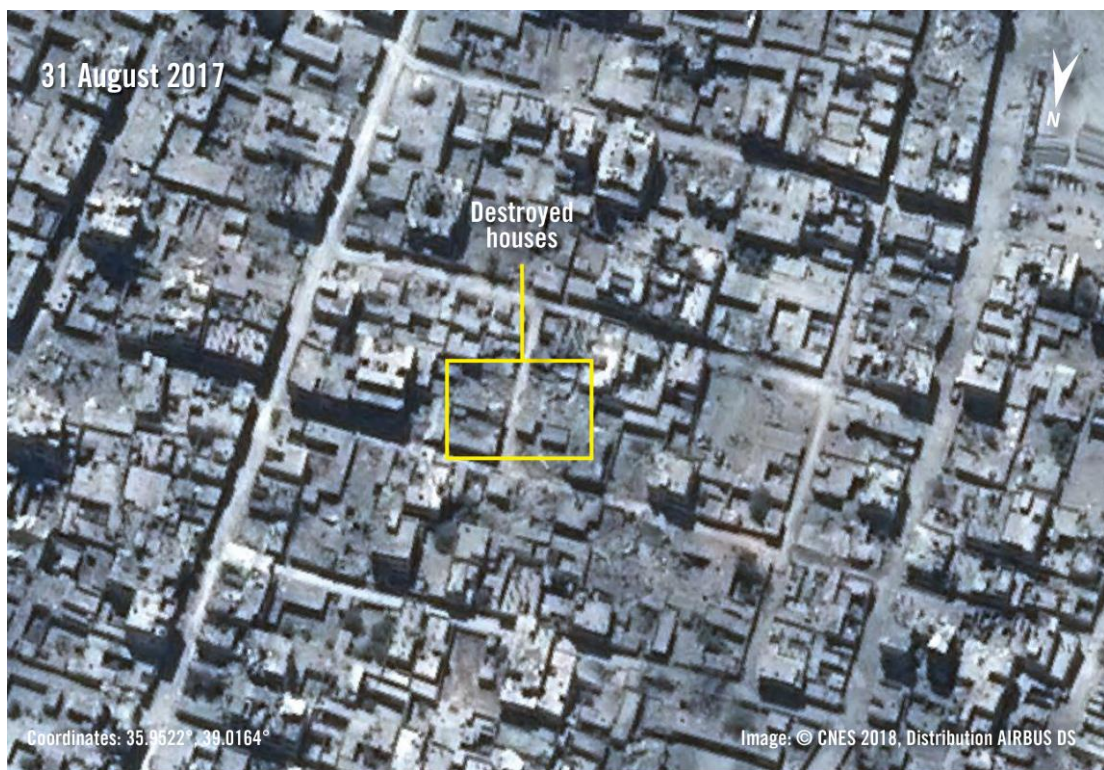
Satellite images showing the house where 28 members of the Badran family and five neighbours were killed in a Coalition strike on 20 August 2017, before and after the strike.