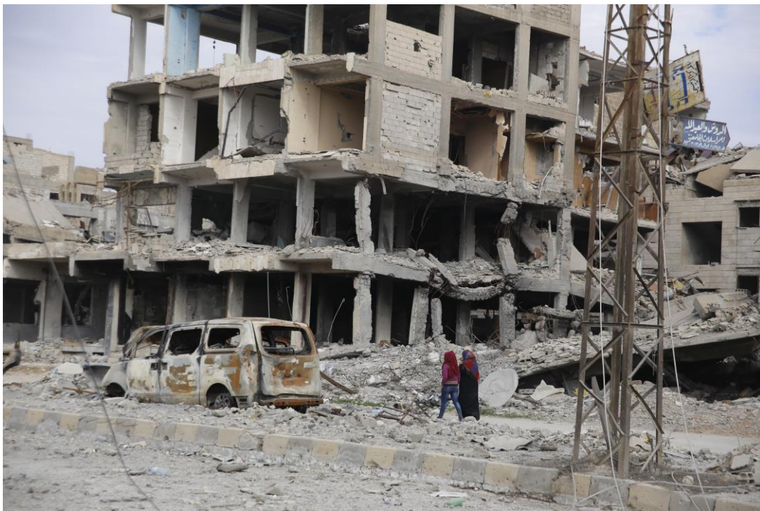
Women walking in rubble-strewn street past destroyed buildings in Raqqa.

Amnesty International’s August 2017 report also detailed IS abuses against civilians during the battle for Raqqa, particularly IS’s use of civilians as human shields as the conflict got underway and the group redoubled efforts to prevent residents from leaving the city. IS laid mines/IEDs to slow advancing SDF forces and to render exit routes impassable, 7 set up checkpoints around the city to prevent residents from leaving, and its snipers shot and deliberately killed civilians who tried to escape. 8 As the SDF captured neighbourhoods and front lines shifted within the city, IS forced residents to move deeper into areas which remained under its control.